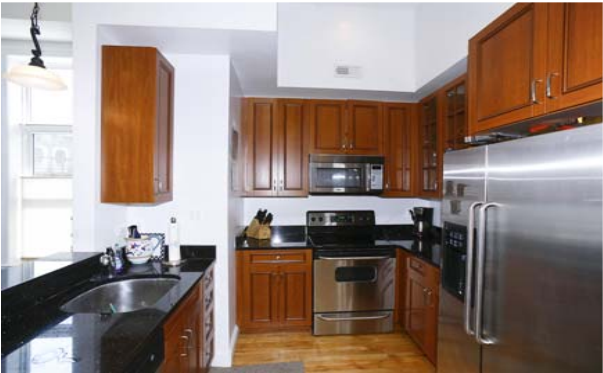
MODERN KITCHEN WITH GRANITE COUNTERTOPS, MAPLE CABINETRY AND STAINLESS STEEL APPLIANCES