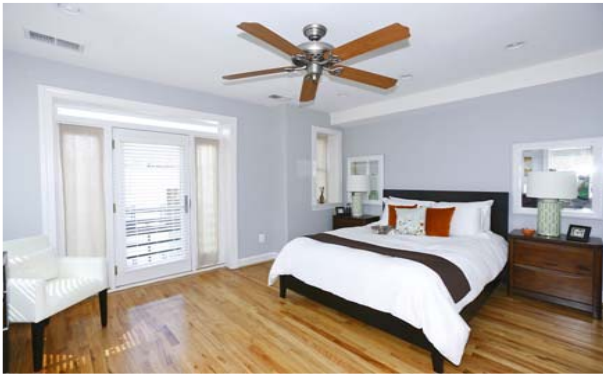
MASTER SUITE WITH TWO WALK-IN CLOSETS AND BALCONY