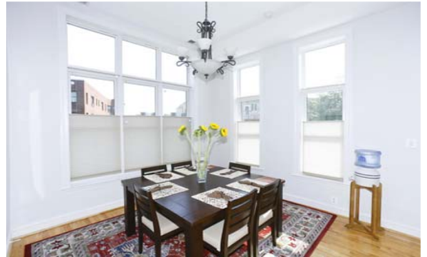
SEPARATE DINING ROOM